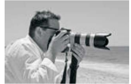
All entries become property of District 5360.

Submit high-resolution digital photos easily online and see contest details: http://rotarianpeacephoto.org