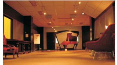
The Salon Stage

A collection of musical instruments and memorebalia is displayed in the Cantos building. There are other such collections in Europe and the U.S.A., but this one is unique in Canada. Of particular interest is Elton John's piano that he used in 1968 though 1972 to compose those tunes that ended up making him so popular today. The piano was acquired in 2004 with a $225,000 donation. Also of note is a piano made in 1926 in Calgary by a company by the name of Mathews Piano.