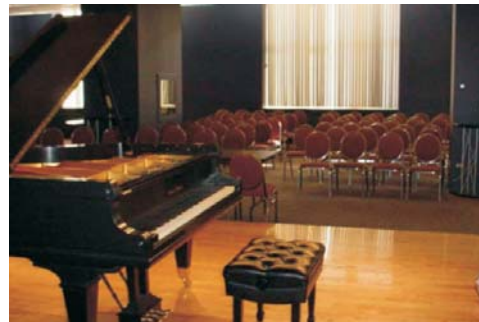
The Cantos Music Room