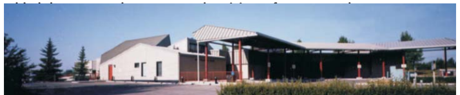
Cont'd on page 2 ...

Needless to say, the specialized equipment needed at our school is very expensive. Special chairs for our kindergarten class cost $750.00 each. Your generous donation last year enabled us to buy a bike costing over $4,000.00. Thank You !! In the past three years we have grown so we've