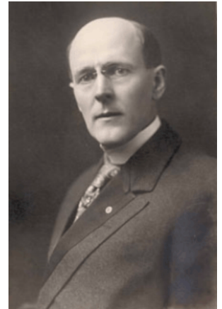
Paul Harris, circa 1915.

I wish you all of the prosperity which your good deeds merit. May all things you ought have be yours. May your charities rank among your necessary expenditures. May you not fall into the popular error of thinking that happiness is to be found in outdoing your neighbors. May it always be yours to look beneath the veneer of life to the solid substance which lies beneath. May you be builders, not mere climbers. May you be able to appraise life's blessings at their real worth. May you be free to act in accordance with the dictates of your own conscience and good judgment. May you not be slaves to meaningless customs, social or otherwise. May you shun the groove followers. May you have vision to discern the right and health, strength and will to do it. That is to say, I wish you a happy New Year.